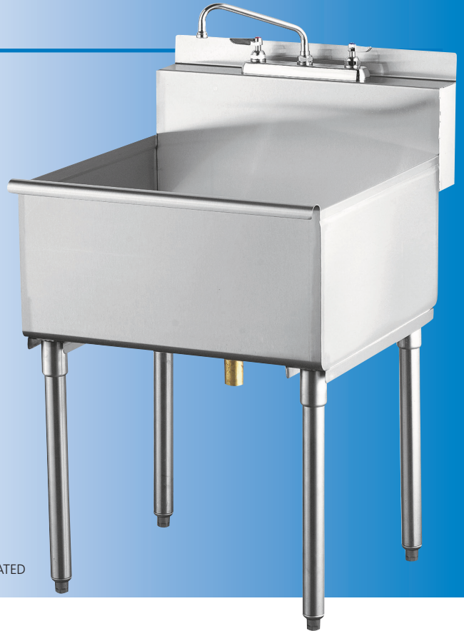
QSES-1 MODEL ILLUSTRATED

Designed with several unique features, these QUEST sinks deliver great value for lighter duty and utility applications. There are also a number of popular options available, such as clip-on drainboards, rack slides and pre-rinse assembly, to build a terrific under counter dishwashing station.